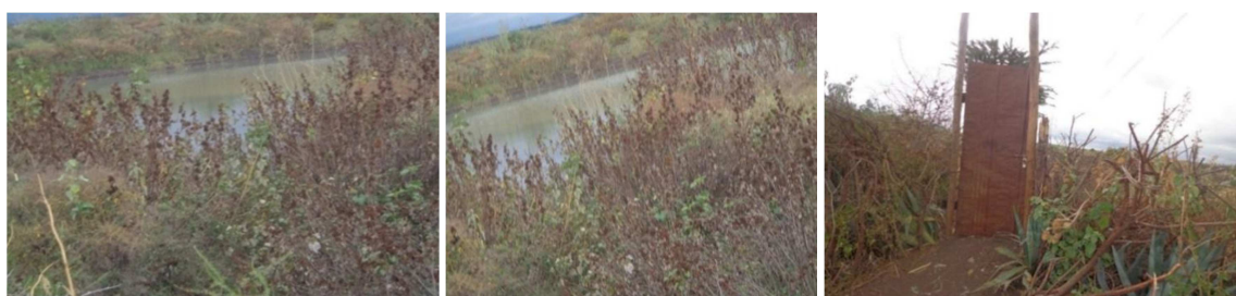
Figure 6. Showing well protected community pond at Oda Bela kebele in Miesso district.

However, we were observed the well fenced and protected earth excavated community ponds in Oda Bela kebele which have been serving the local community for domestic use and livestock watering. As it was observed from the figure 6 below, this pond (Haro hoji qoda) was protected by vegetative silt trap.