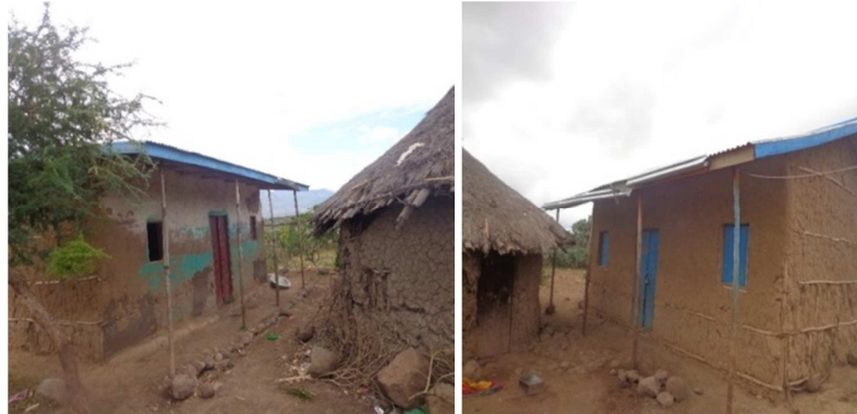
Figure 4. Showing roof top rain water harvesting practice in the study area.

effectively for rain water collection (Figure 4). Some respondent relate this low utilization with lack of water storage materials (tanker). Failure to give full attention for roof water harvesting is additional weakness observed in the study area.