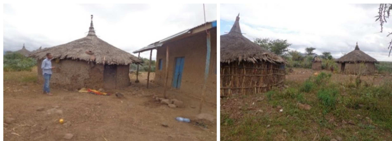
Figure 3. Showing roof top rain water harvesting practice in the study area.