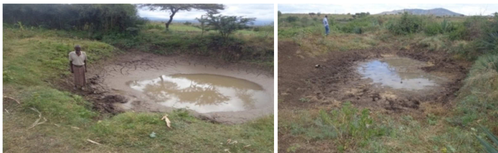
Figure 5. Traditional RWH technology (Kure) at Hamaressa kebele farmer's farm land.

Kure (traditional RWH) is simple earth excavated pond construct constructed for flood water harvesting [17]. It is simple and can be managed by the community. This was due to its less cost i.e. only labor involvement is required. The size of this structure is different among different farmers based on their interest.