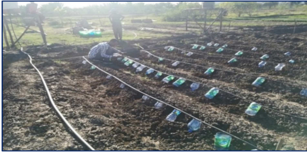
Figure 3. On field installation of catch can Calibration of emitter.

the drip emitter discharge rate was calibrated at field condition and the emitter distribution uniformity were estimated. According to the result, the actual discharge rate of the emitter was 0.87l/hr while the designed discharge rate of the emitter was 1.1l/hr. The lateral is designed for 20% emitter flow variation plus sub mains is designed for a 10% lateral flow variation and the overall irrigation application efficiency was about 85%.